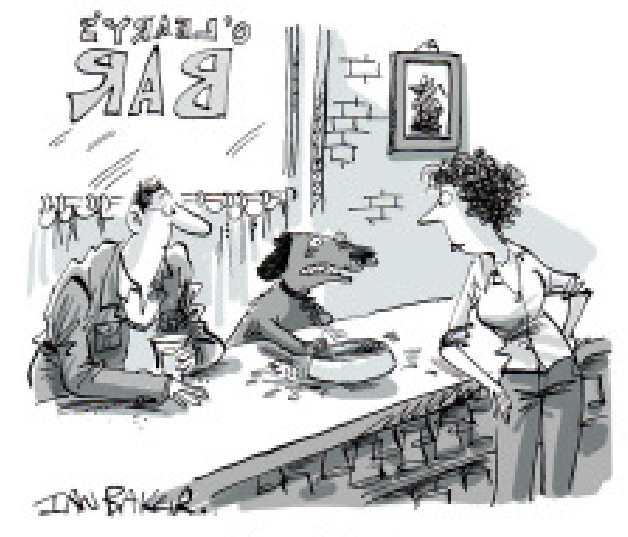
" SAME AGAIN ... "