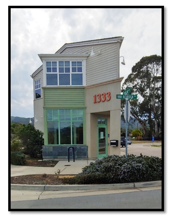
1333 Van Beurden Drive, Los Osos